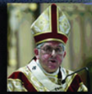
Thomas Cardinal Collins Archbishop of Toronto